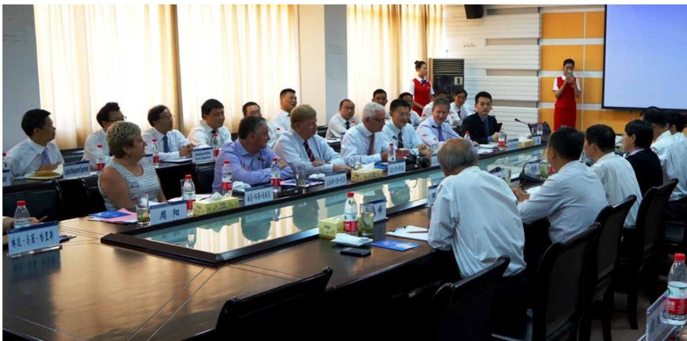
Discussed possible students and teachers exchange at Enshi Polytechnic.