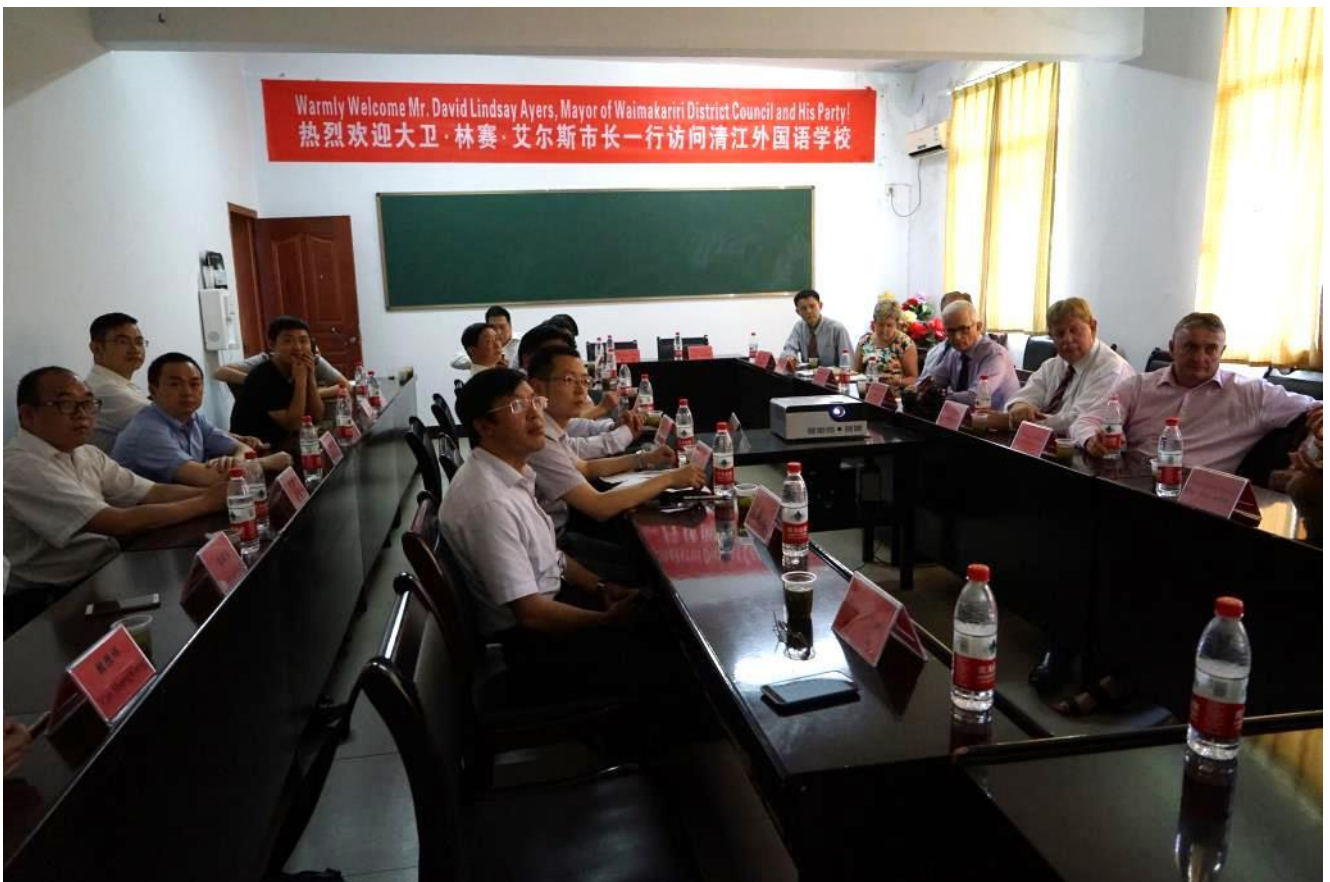
Discussed student exchange at QinJiang Foreign Language School.