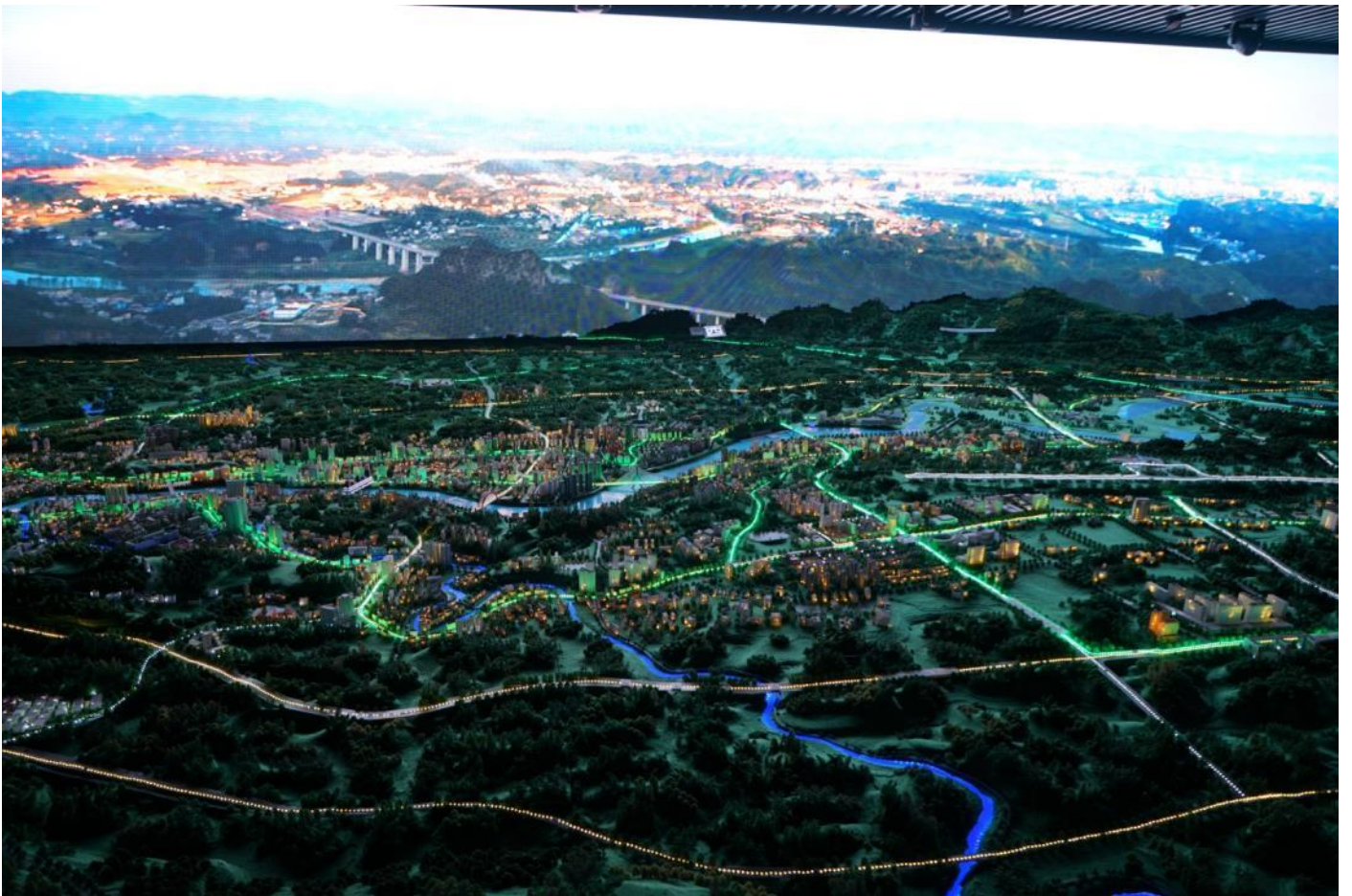
Beautiful Enshi city model and video show