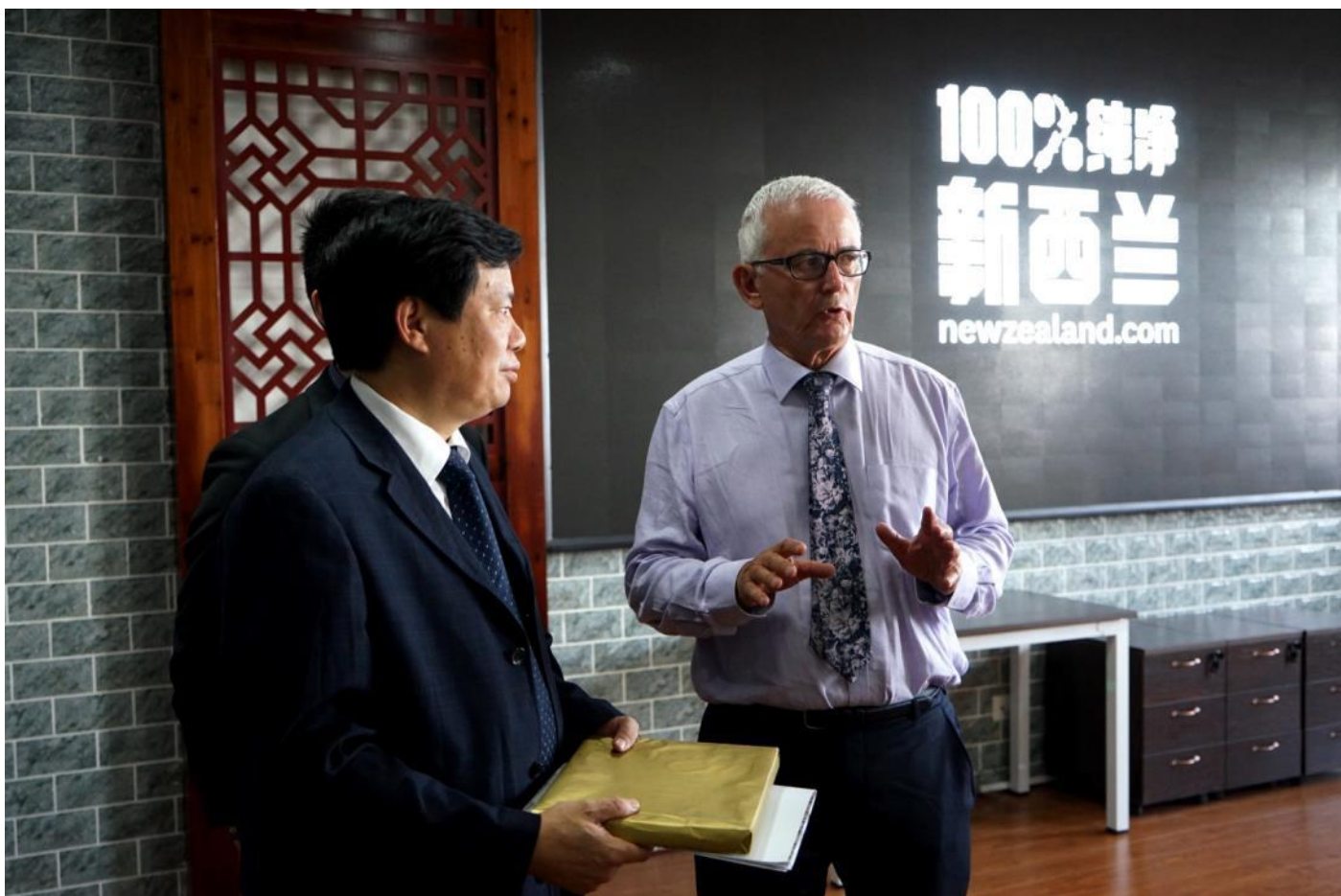
100% pure New Zealand had been promoted by Waimakariri mayor delegation