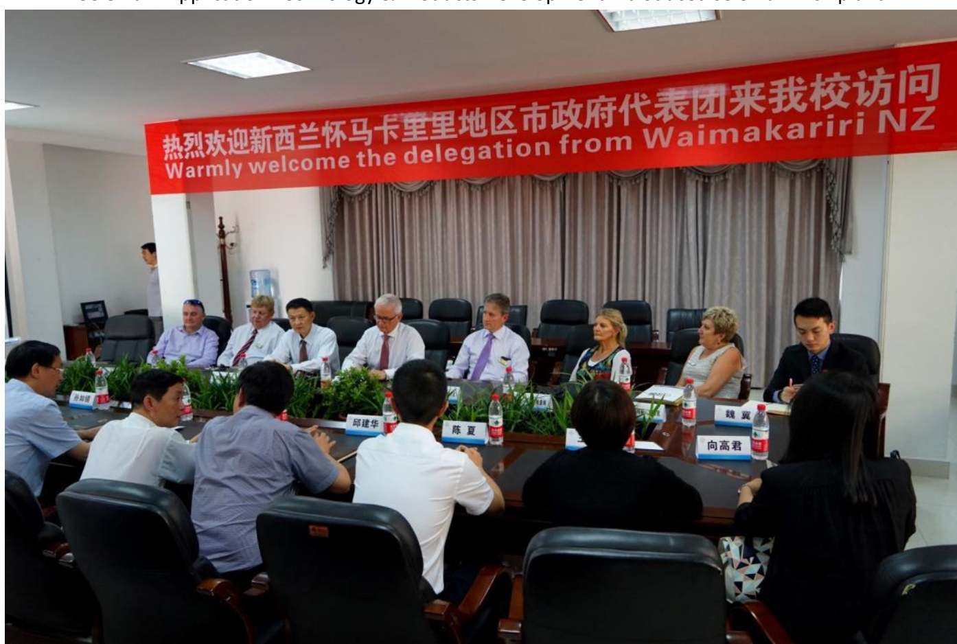
Visited Enshi High School, discussed students exchange program proposal between two cities.