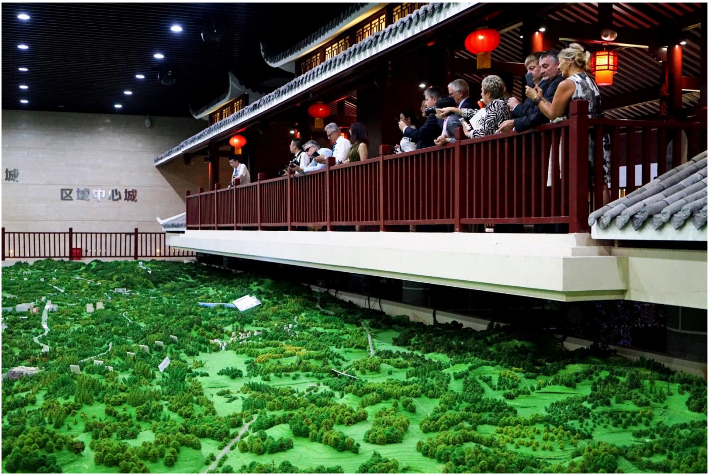
Enshi Exhibition/Convention centre, Bird view of Enshi