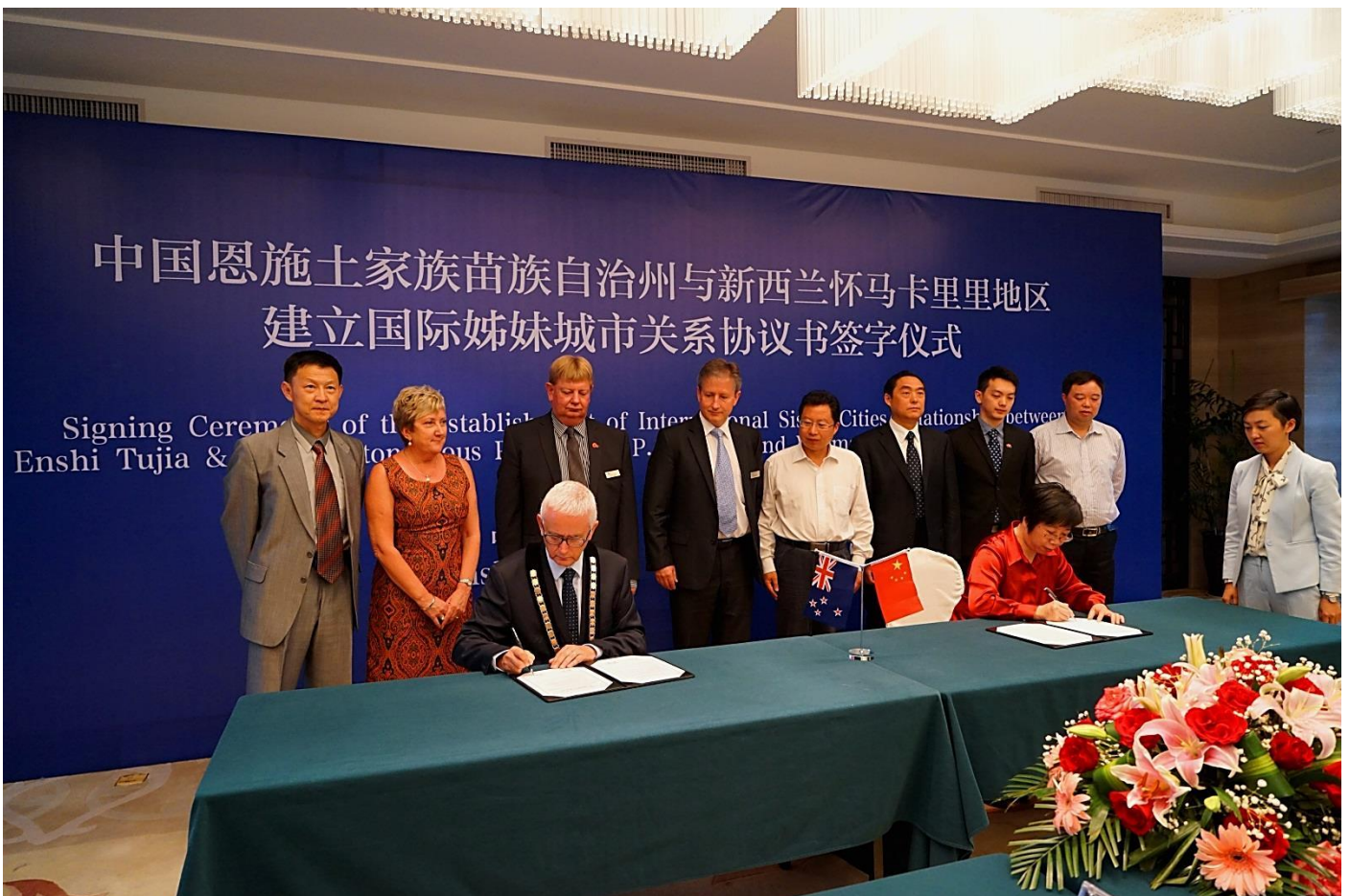
A significant mile stone: sister cities relationship was established.