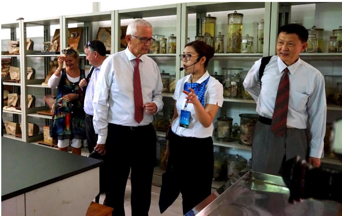
Visited Enshi Polytechnic