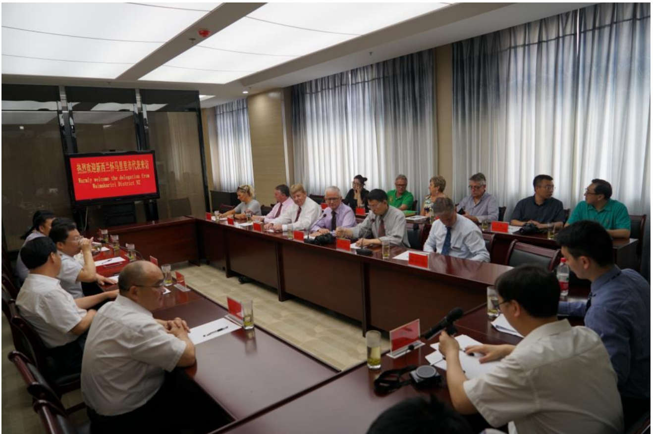
Visited State Selenium Products Inspection and Testing Centre Improved the understanding of selenium to the health of people.