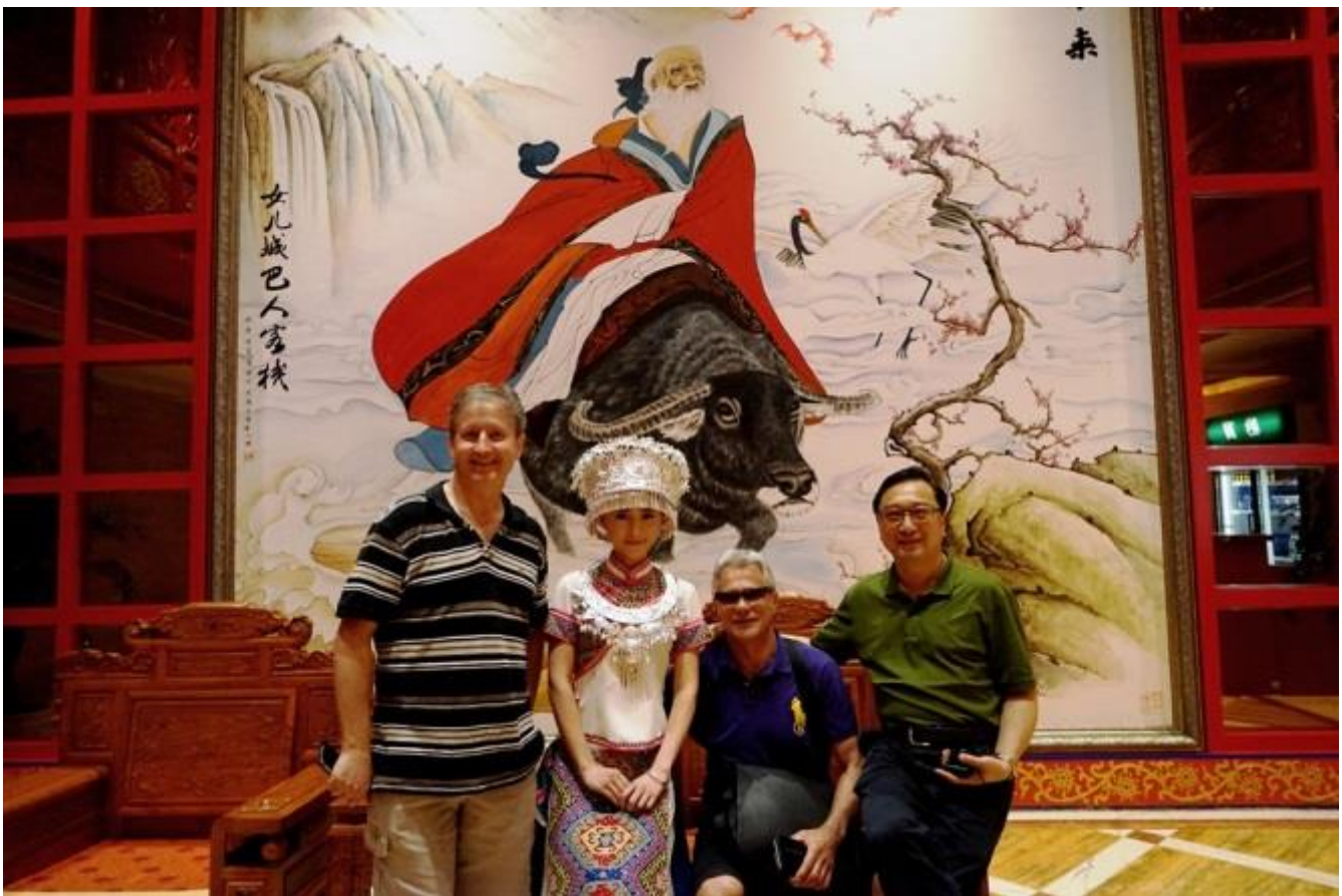
Admire the costume and pretty girl of Enshi Tujia and Miao minority