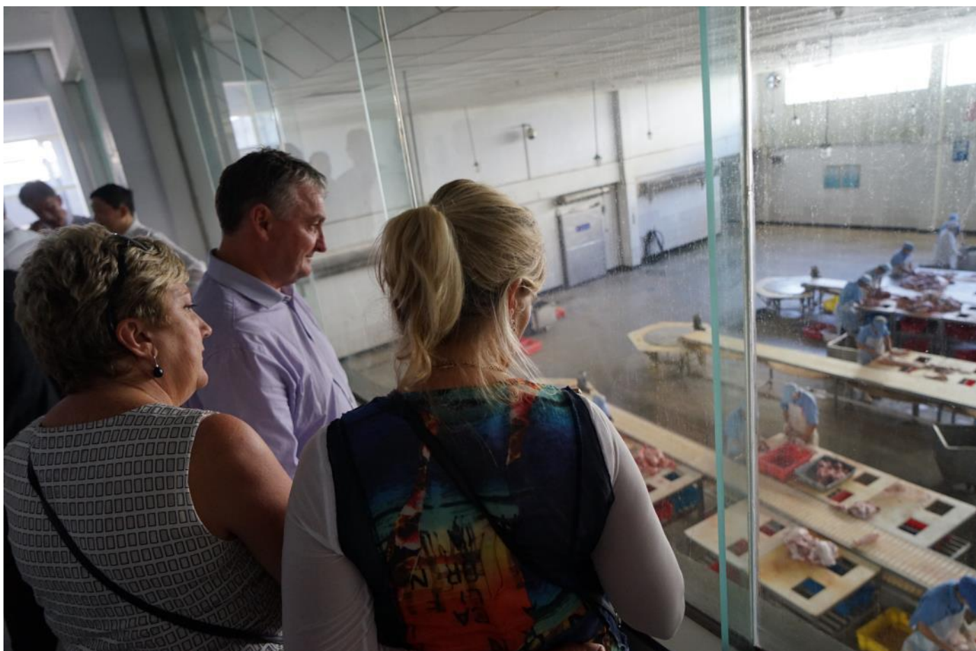
The visit of a meat processing factory of Sile Group