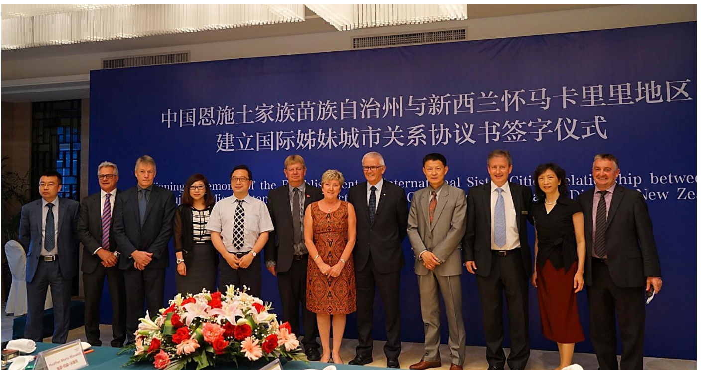
All delegation members were pleased in the sister cities relationship establishment