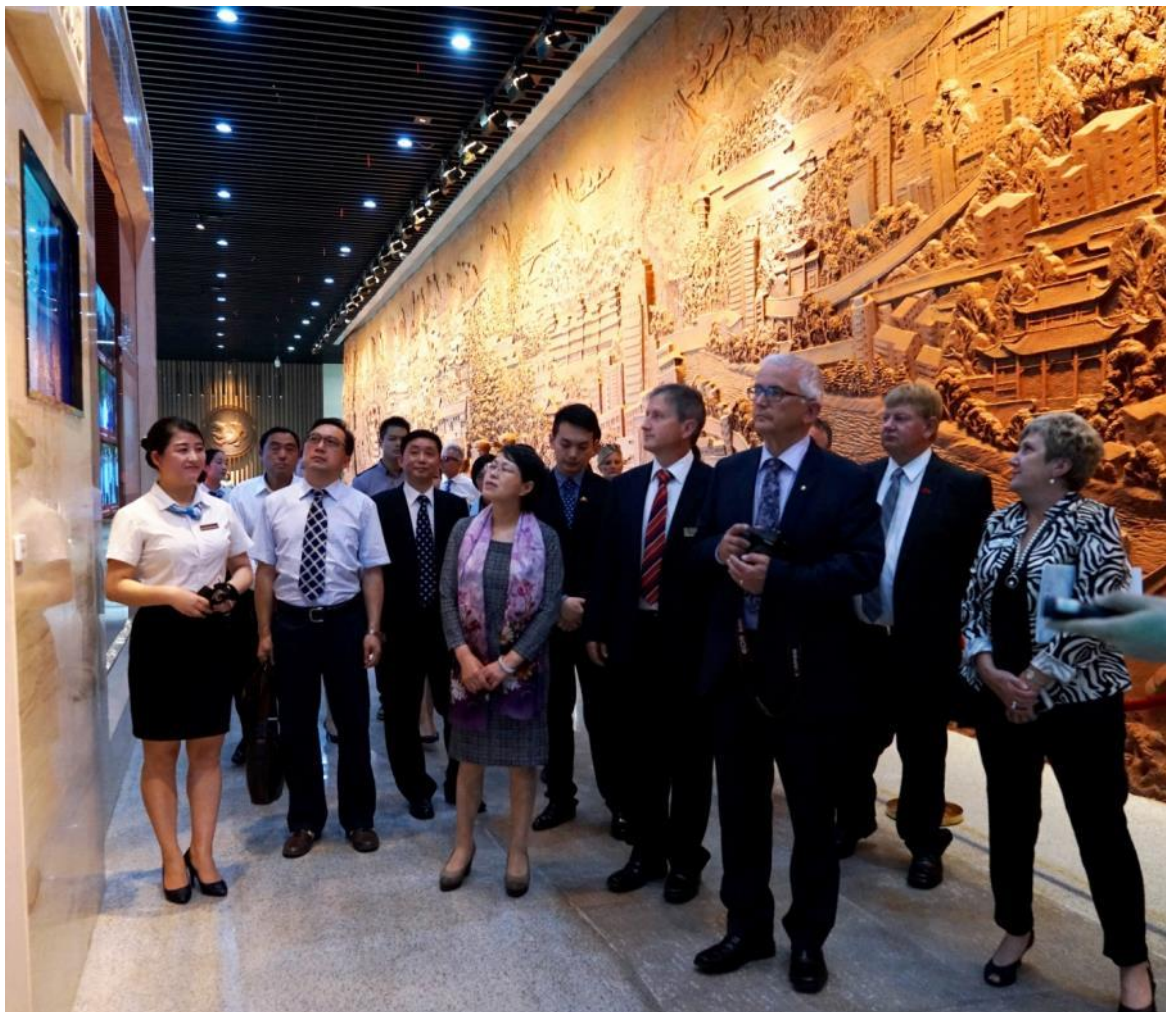
Visited Enshi Exhibition/Convention centre