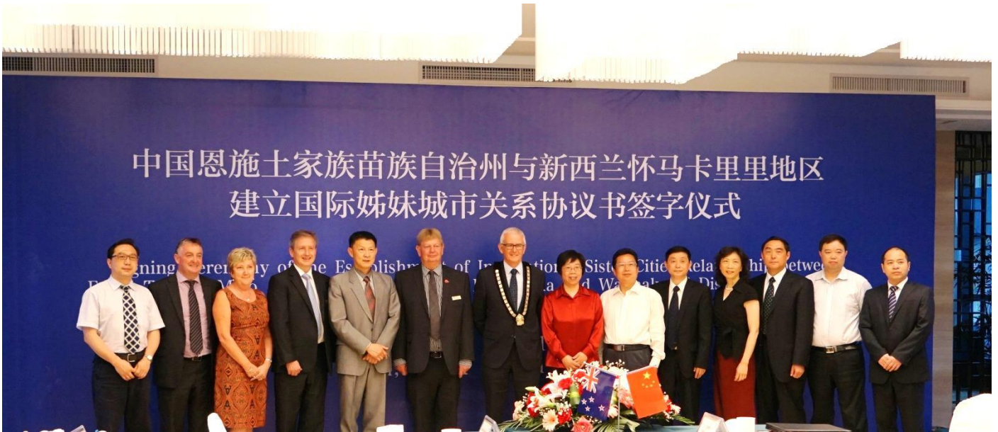
Waimakariri delegation and Enshi government representatives were all pleased of the establishment of the sister cities relationship